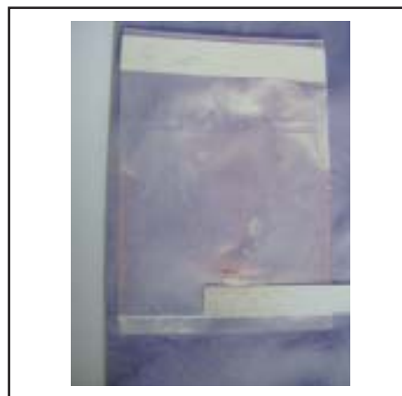
Figure-1: Homogenizer Bag

Surface of the wound is first washed with normal saline in order to wash topical agents. It is then washed with solution of cetrimide and chlorhexidine (Savlon), in order to remove contaminants. A biopsy for the bacteriology was performed with the help of No.3 or 4 dermal punch. Specimen was then elevated with the help of tooth forceps. Biopsy was directly put into sterilized pre weighed homogenizer bag containing 1ml normal saline (Fig-1). This bag was re-weighed. Weight of the tissue was obtained by subtracting the first weight from the second reading by formula