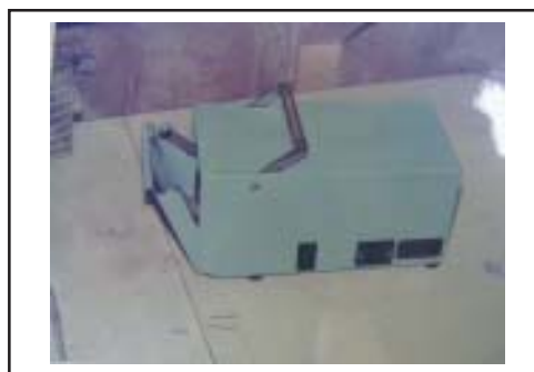
Figure-2: Lab Blender Stomacher

Already prepared blood agar plates are taken and divided into four quadrants as 1/10,1/100,1/1000 and 1/10,000.Each quadrant receive 0.01ml of homogenate, dropped over