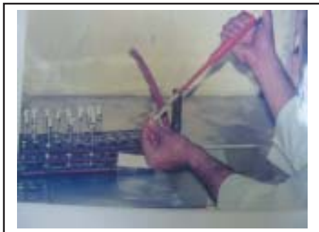
Figure-4: Ten four dilutions of inoculum are made

In addition to these 54 patients, this technique was employed in 21 burn patients, whose wounds were clinically ready for receiving skin