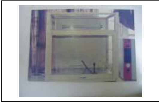
Figure-3: Safety Chamber for inoculation

the blood agar plate from a height of 2.5cm from respective test tubes. Plates were then placed in incubator at 37°C for 15 minutes with lids slightly open at one corner. Lids are then replaced back on plates and plates are incubated for 24 hours. The numbers of colonies are counted at the end of 24 hours (Fig.5). Colony count per gram of tissue was obtained by the following formula of Miles & Misra. 14