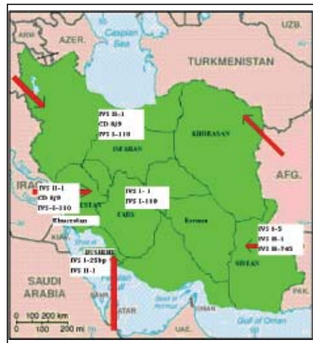
Fig-2: The origin of mutant alleles with high frequency within different parts of Iran. The most frequent beta-gene mutations in each ethnic region indicated individually.

We attempted to detect the most frequent β-thalassemia mutations in Khuzestan and Booshehr (Southwest and Southeast regions), Isfahan and Fars (Central Part). Different authors have reported various mutations that are most prevalence in Khuzestan. In a work done