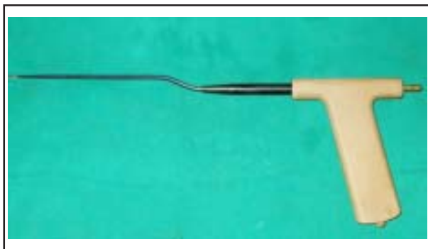
Fig-1: Active Electrode used for posterior transverse cordotomy.

time of presentation were given anesthetic gases through tracheotomy tube while those without tracheotomy were intubated per orally utilizing small sized endotracheal tube. An appropriate sized laryngoscope was used and suspended to expose the larynx. Larynx was sprayed with 4% xylocaine solution. Ziess OPMI microscope with 400 mm lens was used to visualize the vocal cords. The junction of vocal process of arytenoids with membranous part of vocal cord was identified by palpation with micro-bore metallic laryngeal suction catheter. The passive electrode of the electrocautry machine was applied to the left calf and a 30 cm long active electrode (Fig-1) was used to make a transverse incision at posterior part of membranous vocal cord just anterior to the vocal process of arytenoid, a site which was earlier identified by palpation. Care was taken not to expose the cartilage. Active electrode is insulated throughout its length to avoid mucosal injury except at its distal cutting edge. For better control, foot switch of electrocautry is used by the surgeon to activate the cautry. Injury to the anterior two thirds of