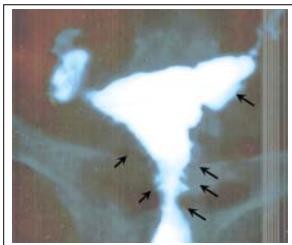
Figure-3: Hysterosalpingographic finding of multiple spicules extending from the endometrium into the myometrium in a patient with adenomyosis uteri

Intraoperatively, 13 (56.5%) patients had diffuse adenomyosis and 10 (43.5%) patients had focal adenomyosis. Coexisting uterine fibroid was found in 17 (73.9%) patients, most of which were insignificant fibroid seedlings in 13 (76.5%) of the 17 patients. Only two (8.7%) patients had co-existing endometriosis. Pelvic adhesion was encountered in seven (30.4%) patients, of which four of them had had previous myomectomy (Table-III). All the 23 patients had biopsy from the affected myometria and only 6 had partial local excision. Of the 23 patients, only one patient could be placed on gonadotrophin releasing hormone analogue.