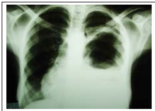
Fig-1: Chest radiograph showing left-sided tension pneumothorax, mediastinal shift and tracheal displacement.

She was taken operating room immediately. Tube thoracostomy was placed, where there was a considerable air leak and some fluid came out. Left anterolateral thoracotomy was performed through the 5 th intercostals space. During operation, a giant perforated hydatid cyst (12x10cm) was found, outside the pericardium displacing and compressing the left lower lobe. After aspiration of pleural space, germinal membrane was removed as a whole with a ring forceps. The pericystic cavity was irrigated with hypertonic saline solution. Small bronchial openings were found using saline and with application of positive intrapulmonary pressure, air escaping through any bronchial opening was easily seen with the formation of air bubbles. We closed them separately with 4-0 Vicryl in a figure of eight fashion. And we confirmed the integrity of our closure by asking anesthetist to give a positive pressure.