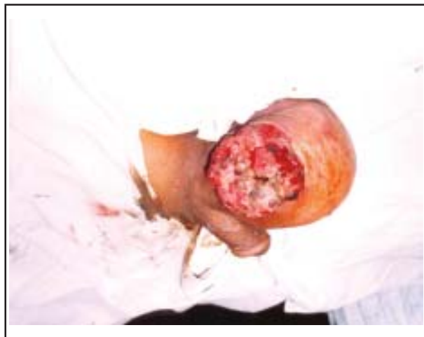
Figure-1: Left testicular fungating and discharging mass (tumor)

His immediate post operative recovery was un-eventful. Biopsy showed embryonal cell carcinoma & post operative \alpha -feto proteins level was 1346I U/ml. His chemotherapy had to be started but within ten days he developed secondaries in high inguinal region which increased so rapidly with in a period of 05 days and acquired a size of 10cm x 5cm. Immediately he was operated and inguinal clearance was done. Tumor was found to be encroaching the walls of penile urethra. On second post operative day he was shifted to oncology department where he received 06 cycle of chemotherapy. On follow up after six months patient was healthy with good recovery.