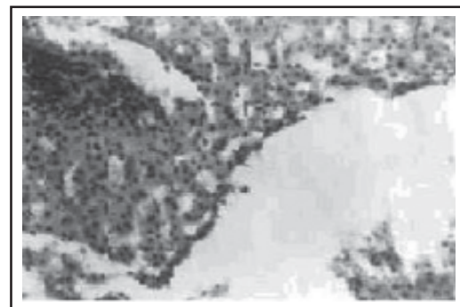
Fig-4: Microphotograph of liver biopsy showing multiple microcysts ( \times 40 ).

Laboratory studies of HMH often reveal normal liver function tests. Serum AFP elevation up to 6000ng/ml has been reported in patients with HMH. Other tumor markers, such as \beta -HCG and VMA are negative. 2,9