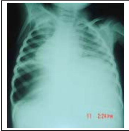
Fig-1: Chest X-Ray showed decreased trans lucency in the right upper and lower zone of abdomen.

The pathology sections showed hepatic nodules and sheaths with intervening loose edematous myxoid connective tissue with dilated lymphatics vessels, fluid-filled spaces and scattered disorganized elongated branching bile ducts & reported mesenchymal hamartoma [Fig-4].