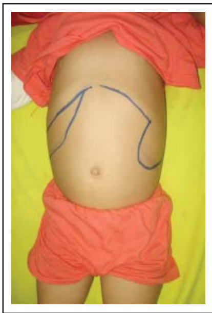
Figure-1: Massive hepatosplenomegaly.

Her complete blood count showed the following results: Hemoglobin: 7.5 gr/dl, total leukocyte count: 2600/mm 3 with 20% polymorphonuclears, 75% mononuclear, 2% monocytes and 3% eosinophil. MCV: 76.2 fl, PLT =66000. ESR was 31/h. Reticulocyte count was 0.7%. Biochemical tests were normal.