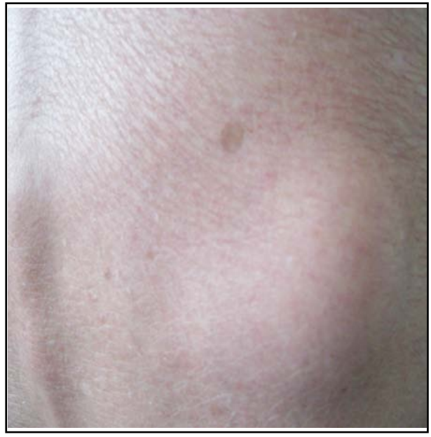
Fig.1: Protrusion in the lateral right the lumbar area.

Computed tomography (CT) scan confirmed the presence of right lumbar hernia containing fatty tissue. After treatment of regular oral theophylline sustained release tablets and prednisone acetate tablets, his respiratory symptoms improved obviously. The patient refused operation and was discharged from the hospital one week later.