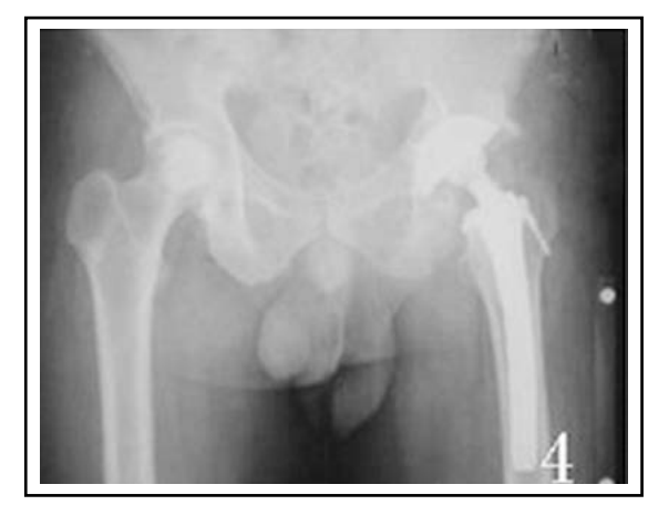
Fig.4: The patient was performed THA with Rebed prostheses.

Femoral offset: We found that the preoperation femoral offset was 3.689±0.7538cm and the