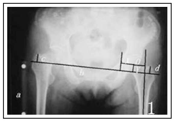
Fig.1: 1, a the maker, the actual length is 10 cm 2 b is the line between bilateral tear-drop 3.The LLD is the difference of the length between c and d 4,X is the value X of rotation centers 5,Y is the value Y of rotation centers, the Length Y=d 6,O is the length of femoral offset.

Patients: From January 2002 to December 2007, a total of 92 primary THA patients with unilateral hip disease aged from 23 to 78 were performed