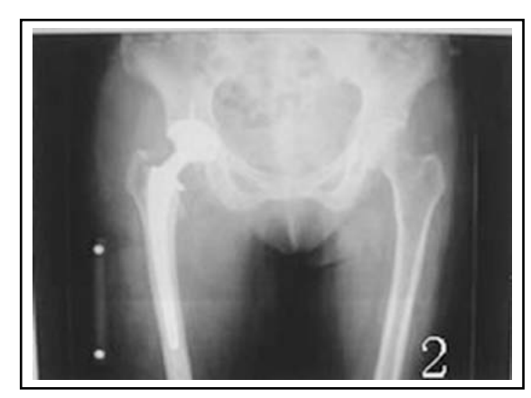
Fig.2: A femoral neck fracture Patient who was performed THA with hybrid prostheses. We used the marker (10cm) preoperative and used the marker or the metal or ceramic femoral head postoperative as the reference.

We used a marker (10cm) to ensure to observe the results of the plain X-rays accurate effectively. Before operation, we strictly observed the plain film using the corporation's templates combined