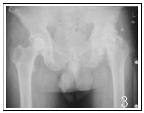
Fig.3: A bilateral femoral head necrosis Patient, whose left hip is very gross, but the right side is basically good and the femoral head did not depressed.

Radiological measurement: All the plain films were taken according to the method that Lindgren<sup>9</sup> introduced. The pre- and postoperative plain X-rays were studied and observed by the same doctor. The femoral offset was measured as the distance from the center of rotation of the femoral head to the long axis of the femoral shaft. The rotation centers X-value was the distance from rotation centers to the tangent line of the teardrop inner margin.<sup>10</sup> The rotation centers to the line of bilateral teardrop. The LLD of postoperative and preoperative was the difference from the peak of the greater trochanter to the line between bilateral tear-drop. (Fig. 1, 2, 3 and 4).