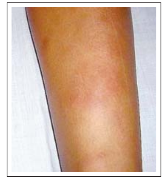
Fig-1: Erythema Nodosum 2,5 mm in diameter over left leg.