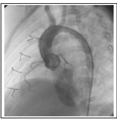
Fig.2: An angiographic view of a patient whose coarctation was removed surgically by the procedure of subclavian flap angioplasty.

Tubular narrowing distal to the subclavian artery was present in 27 (%) patients with a mean diameter of 4.07±1.18.