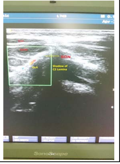
Fig.2: TrM, Trapezius Muscle; SsCM, Semispinalis Capitis Muscle; GON, Greater Occipital Nerve; OcA, Occipital Arter.