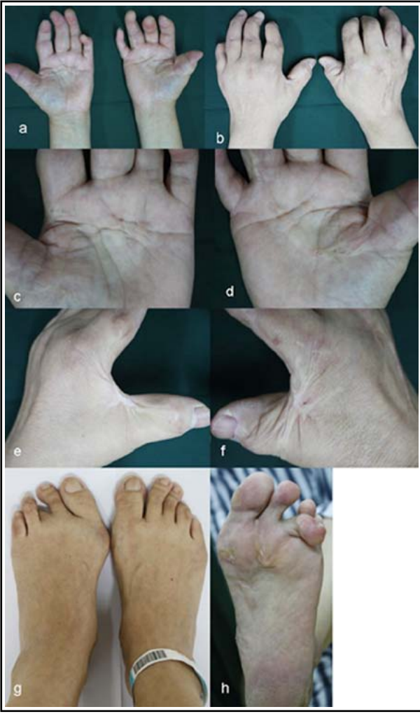
Fig.1: a and b: Overview of both hands showing multiple finger malformations in both hands.

her left thumb. She had a history of progressive hand and foot deformities that began in 1992 as redness and mild pruritus of her right little finger. At the time, conventional radiography showed arthritis in multiple small joints, with evidence of bone erosions in both hands and feet (Fig. 2 a b). Immunological tests were weakly positive or negative for rheumatoid factor (RF, weakly positive twice in 1993 and negative thereafter). She also tested negative for antistreptolysin O (ASO), and had a normal erythrocyte sedimentation rate (ESR) and normal levels of C-reactive protein (CRP), uric