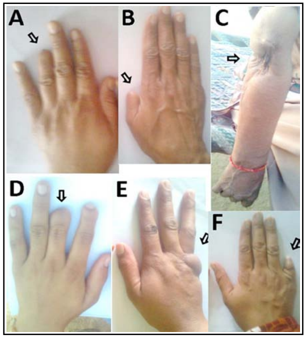
Fig-I: A,B,D. Terminal phalangeal amputations of 4th, 1st and 3rd digits in subjects# 9, 8 and 12, respectively. C. Firearm associated trauma in subject# 13 resulting in non-functional passively hanging arm which also had bluish appearance. E. Postaxial amputation of last digit in subject# 11. Post-traumatic healing and edema is visible. F. Postaxial amputation at the level of proximal phalange in subject# 10.