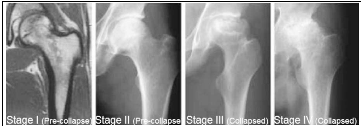
Fig.2: Ficat classification of ischemic bone necrosis of femoral head.

basis of radiography, bone scintigraphy or MRI observations. 17 Moreover, Association Research Circulation Osseous (ARCO) designed the latest, 4-stage classification system. 18 In stage 0, all histological findings are normal. In stage I, radiographic observations are normal but bone scintigraphy or MRI or both detect the early stage IBN. In stage II, radiographic observations indicate abnormalities (mottled femoral head and cyst formation) but none of the modality show collapse of bone tissue. The emergence of 'crescent sign' is an indicator of stage III in which all diagnostic modalities reveal separation between subchondral plate and the necrotic bone. The stage IV describes collapse of bone tissue and emergence of secondary degenerative transformation in acetabulum. 19 The literature survey showed various studies conducted on systemic lupus erythematosus (SLE) patients who were chronically treated with steroids. 20-29