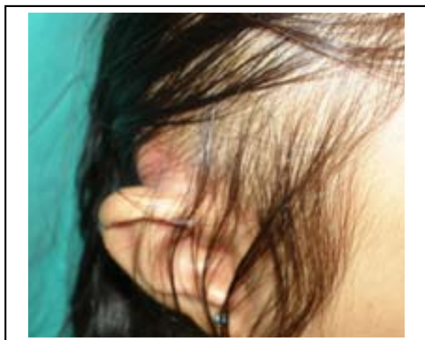
Fig.1: Fluctuant, erythematous and tender swelling at the right postauricular region pushing the helical pinna down facing.

The patient was planned for evacuation of abscess urgently. Although mastoidectomy was initially planned, we have opted to limit the operation for drainage of the subperiosteal abscess together with insertion of tympanostomy tube. This was in view of the presence of adjacent skull defect which might jeopardize the brain vital structure if mastoidectomy is undertaken. A postauricular incision was made to evacuate the abscess. It was few centimeters away from the area of skull defect site, following advice from the neurosurgical team. An attempt to insert tympanostomy tube failed due to the stenosed external auditory canal.