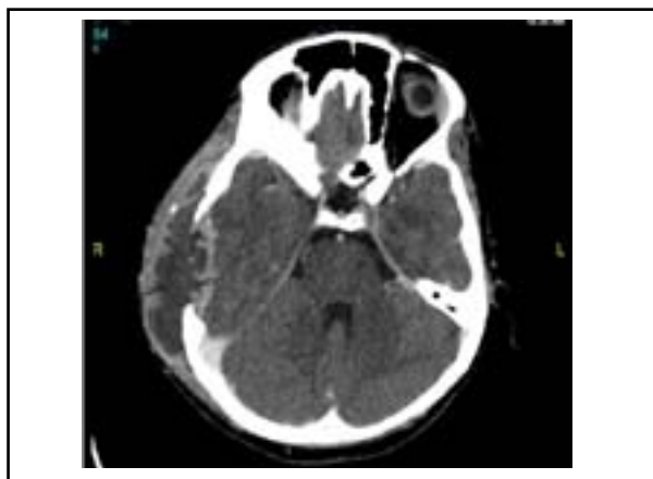
Fig.2: Axial CT scan of the temporal bone at initial presentation demonstrates scalp abscess formation at the right temporoparietal area (white arrow), with destruction of right temporoparietal bone and extension of abscess into adjacent extradural region.

The surgical procedure went uneventfully. Intraoperatively 20 cc pus was drained out. After five days of wet dressing and intravenous antibiotics, the wound was relatively clean, the postauricular swelling and the stenotic external auditory canal had subsided. Operative wound managed to be closed five days later. Her blood glucose normalized and she was discharged on day eight of hospitalization. Pus culture grew Klebsiella pneumoniae . She was continued with oral ciprofloxacin for another two weeks after discharge. She was also prescribed with subcutaneous insulin. A repeat CT scan was obtained 2 weeks after discharge from ward, about a month after initial presentation, to assess the possibility of residual or recollection of abscess and future planning for mastoidectomy if needed. It showed the destruction of the underlying right temporoparietal bone appeared to be same. The initial abscess collection site at the adjacent extradural region was clear. Neurosurgically, she was under conservative management. During the last follow-