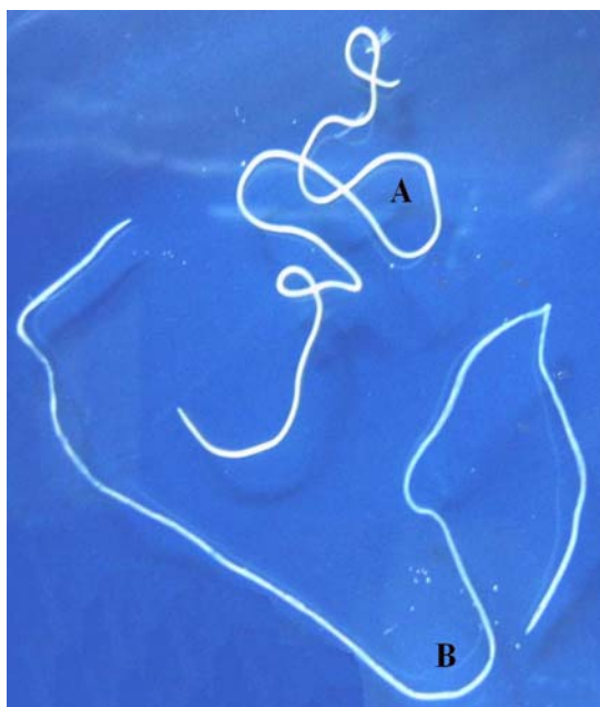
Fig-1: Dirofilaria repens isolated from the cheek A and chest B

Ahvaz city who noticed a single and moveable nodule measuring 15 mm in diameter on his chest. The patient pressed the nodule and a white worm 130 mm in length was observed and identified as D(N) repens (Fig-1B). No microfilaria were observed in peripheral blood and in the nodule or inside the worms. The third case was a 35 year old man from Ahvaz city who presented at Imam Khomeini Hospital because of itching, swelling and redness of the right eye. Examination showed a living white worm 110 mm in length which was removed from the subconjunctival space (Fig-2).