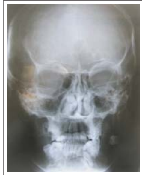
Figure-4: Skull radiography was normal.

(Fig-6). The patient was referred to the Department of Head & Neck Surgery for further treatments.