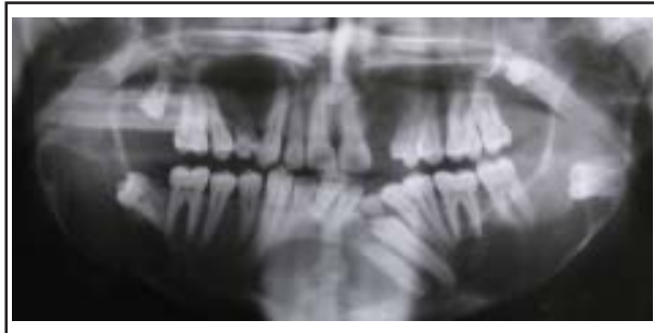
Figure-3: Panoramic radiography showed multiple well-defined, radiolucencies in all four quadrants and impacted teeth.

Diagnosis of multiple OKCs or Gorlin-Goltz syndrome was made for the patients based on clinical findings. Incisional biopsy from the left side of the mandible was performed under general anesthesia and the cutaneous lesion was removed by excisional biopsy. Histopathology revealed a thin, uniform layer of parakeratinized stratified squamous epithelium with a corrugated surface and a prominent palisaded basal cell layer of the jaw cyst. The epithelial lining was supported by a thin, fibrous connective tissue wall containing a mild chronic inflammatory cell infiltrate. The cysts were filled with eosinophilic flakes composed of keratin (Fig.5). Histopathological examination of the cutaneous lesion revealed orthokeratinized stratified squamous epithelium in the lining of a cyst with a granular cell layer. The wall of the cyst was composed of fibrous connective tissue and the lumen was filled with keratin. The diagnosis of epidermal cysts was confirmed