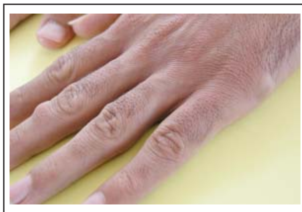
Figure-2: Epidermoid cysts on the hands of the patient.