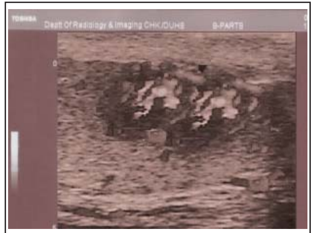
Fig-2: Testicular tumor. Longitudinal CDS image of the lower half of the testis shows a hypoechoic poorly marginated hyper vascular mass.

There were 13 cases of varicocele (18.57%)