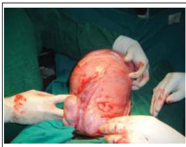
Figure-1: Huge fibroid removed at surgery 3.4kg

She had myomectomy on the May 2 nd 2007 under general anaesthesia. The findings at surgery were: a huge intramural and subserous fundal fibroid weighing 3.4kg (see Fig 1 & 2) and a smaller one 2×4cm in the anterior uterine wall. The right ovary was normal while the left ovary was enlarged with an intact corpus luteum. The fibroids were enucleated via a midline fundal incision with an anterior and posterior extension. Following enucleation, the resulting cavity was obliterated by carefully approximating the myometrium (using vicryl two on round bodied curve needles), in three layers over the wall of the gestational sac. The uterine serosa was repaired by imbrication with vicryl 1 on a round body needle. The blood loss was 500mls.